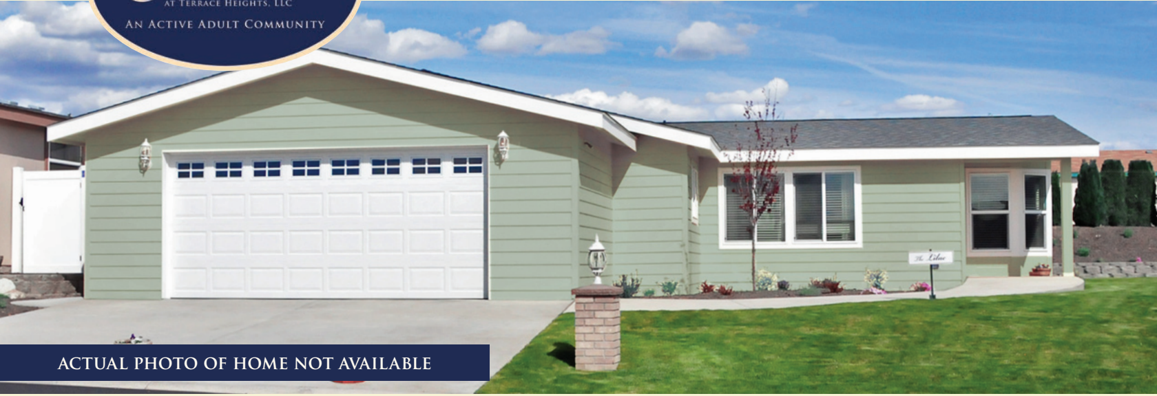
ACTUAL PHOTO OF HOME NOT AVAILABLE