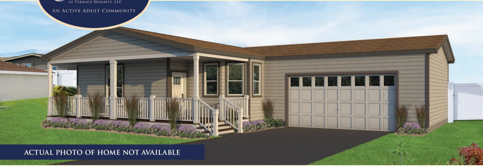
ACTUAL PHOTO OF HOME NOT AVAILABLE